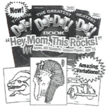
The Greatest Dot-to-Dot Books in the World!